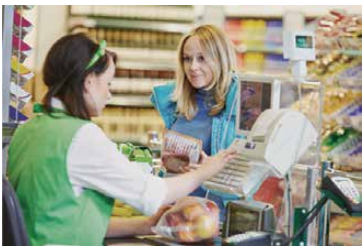
RETAIL CHECK STANDS, BANKS, POST OFFICE, AIRPORT COUNTERS, AND HOSPITALS