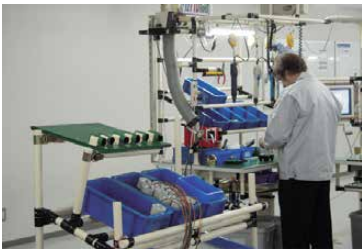
LEAN MANUFACTURING WORKSTATIONS