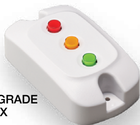
INDUSTRIAL-GRADE CONTROL BOX