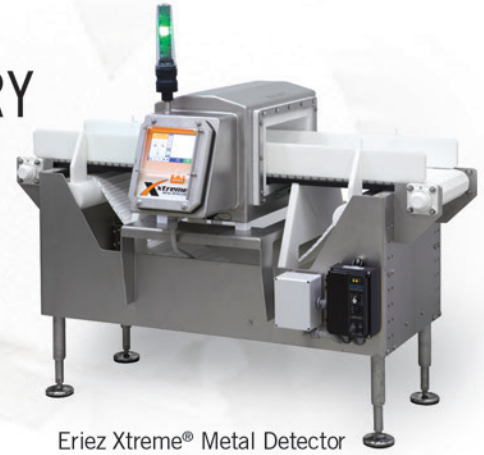
Eriez Xtreme® Metal Detector

PATLITE also offers product solutions for extremely cold environments (warehouses, refrigerators, freezers), which are able to withstand extremely cold temperatures down to -40 degrees C (-40 degrees F).