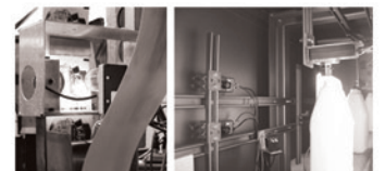
Lighting for Vision Systems