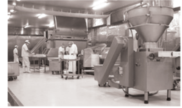
Warning Light for Maintenance