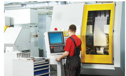
CNC Milling Machine