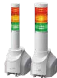
Network Monitoring Signal Tower NH-FV Series

By using the NH-FV Series print monitoring and audible notification features, you can remotely notify printing instructions.