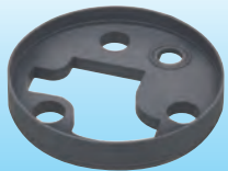
Optional Rubber Gasket SZ-200A